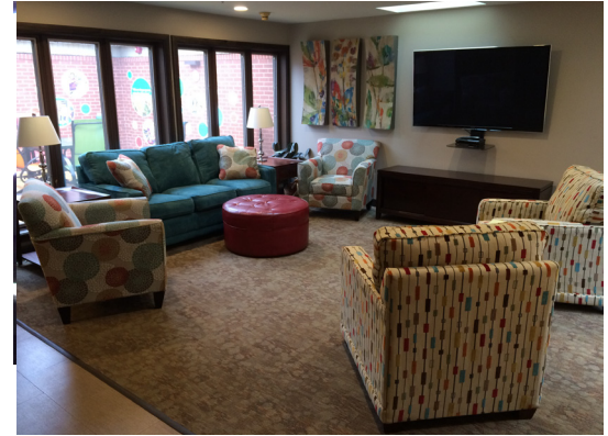
Before and after: These pictures were taken before (pictures on the left) and after (pictures on the right) our renovation. Our guest bedrooms and family room received some beautiful and modern updates through the renovation!