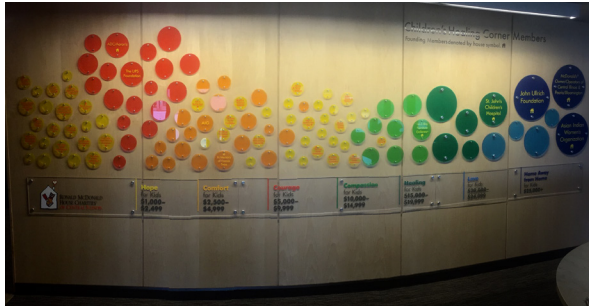
Pictured above: Our new Children's Healing Corner Donor Wall in front entryway