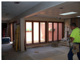
Three pictures to the left: photos of the construction process

Our "Labor of Love" renovation and expansion was a $1.2 million project that began construction in June 2014 and completed in October 2014. It was the first complete remodel in the nearly 30 year history of RMHCCI. Not only did the House receive much needed updates to the structure and interior, the project also allowed for the addition of two guest bedrooms by repurposing existing space within the House. The Labor of Love renovation and expansion has enabled RMHCCI to serve more families than ever before and for years to come!