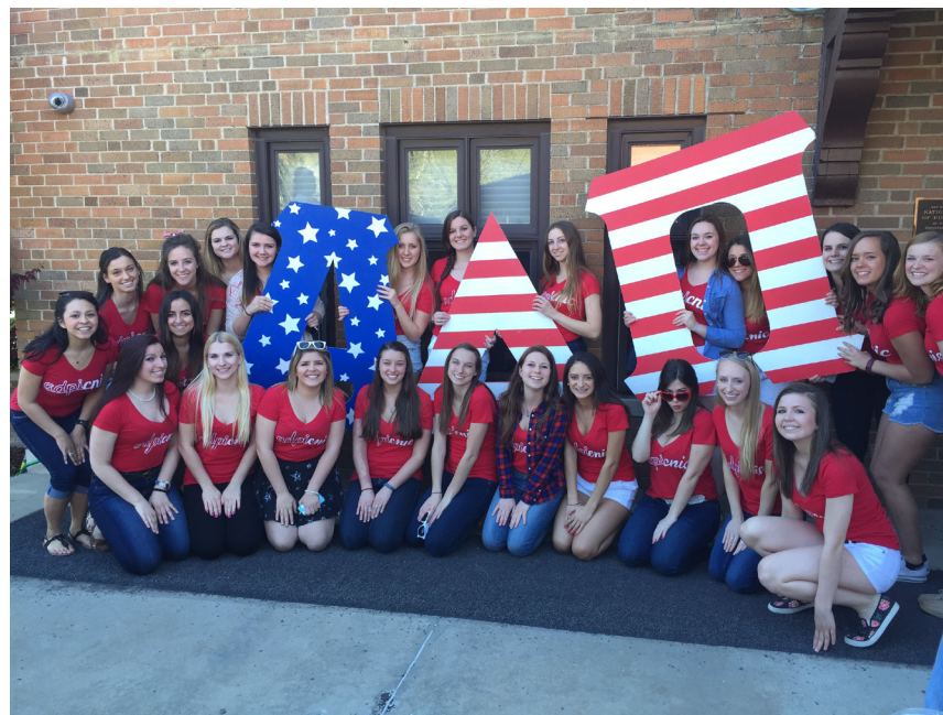
The women of Alpha Delta Pi at UIUC put together an awesome "ADPicnic" for our benefit this spring. They had a great turnout and "Pi an ADPi" was quite a hit!