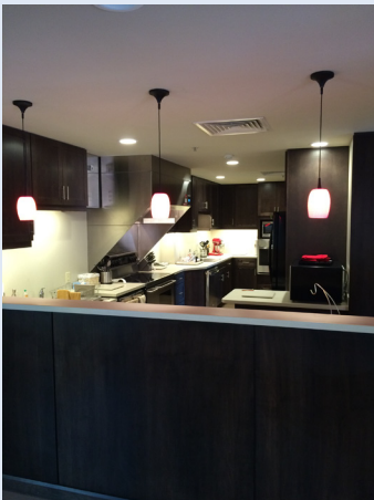
Pictured far left: New dining area Pictured left: New kitchen Pictured above, top: New family room Pictured above, middle: New guest bedroom Pictured above, bottom: Children's Healing Corner Donor Wall