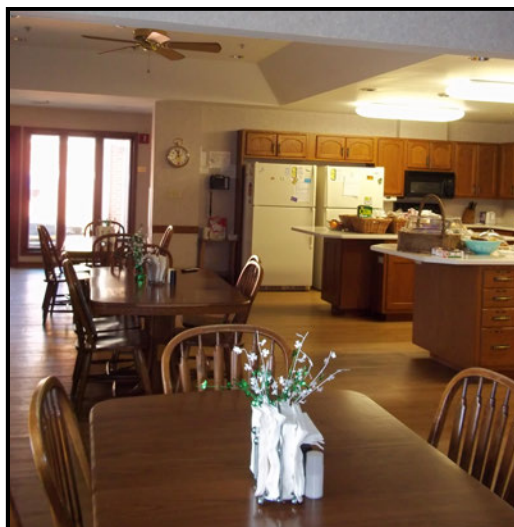
RMHCCI Kitchen, tables & chairs original from opening in 1986.

RMHCCI is working with FWAI Architects as the design & architectural firm for the project. In addition, since 1986 St. John's Hospital has leased the property to RMHCCI