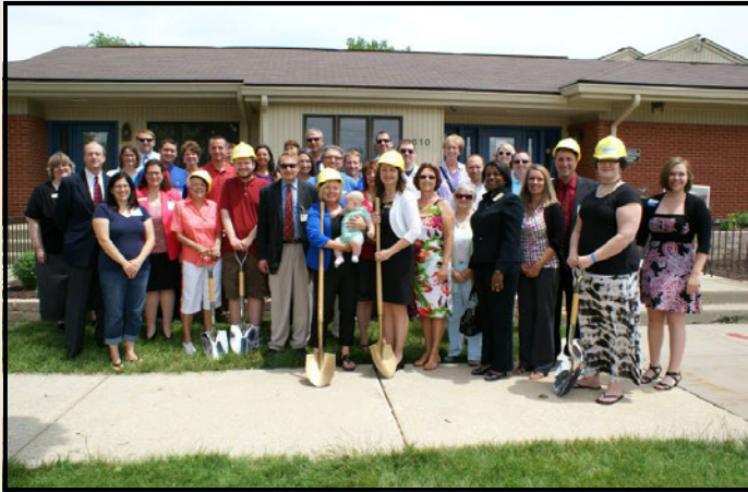
RMHCCI Board Members, Renovation Committee Members, Adopt-the-House Sponsors, volunteers, staff, & attendees at the Groundbreaking Ceremony on 6/12/14.