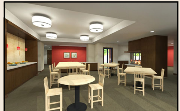
Interior rendering of the proposed kitchen.

RMHCCI has been well-maintained but used by thousands of families since we opened in 1986 — some furnishings are over 25 years old.