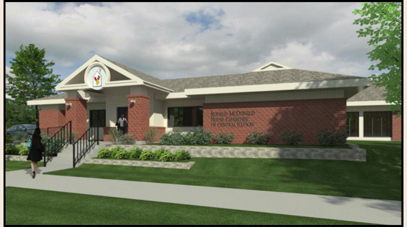
Exterior rendering of the remodeled Ronald McDonald House.

Please visit roominyourheart.org to learn more!